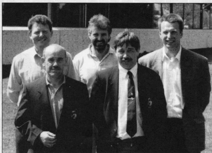
Upholders of a proud tradition – our British team of greenkeeping golfers

I use the term sans golf, for it is not being too critical to say that the golf at Nunspeet, or more specifically the golf course, whilst being charmingly pretty and delightfully set in what should have been perfect golfing country, with pines, heather and delicious sandy loam soil, was a disappointment. I do not know the name of the architect, though I understand he is of aristocratic blood, but I hope someone will take him aside very soon and tell him what a golf course ought to be about. Here