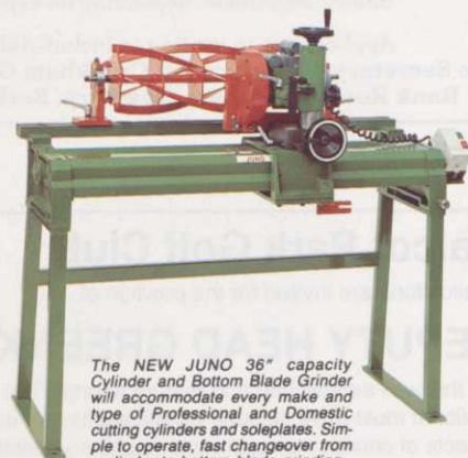
The NEW JUNO 36" capacity Cylinder and Bottom Blade Grinder will accommodate every make and type of Professional and Domestic cutting cylinders and soleplates. Simple to operate, fast changeover from cylinder to bottom blade grinding.