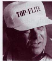
Trevino: AIDS cure

■ What do you give to the man who has everything? The legendary four-some, Nicklaus, Palmer, Rodriguez and Trevino, competing in the 1992 Senior Skins Game in Hawaii in January were asked to reveal their ideal gift – and their New Year's Resolutions. Jack Nicklaus: 'My ideal gift would be lasting peace among all the people of the world, my resolution to work harder at being fit so that I can give myself a chance at winning a major in '92'. Arnold Palmer: 'My ideal gift would be a Cessna Citation VII airplane (he already owns a Citation IV), my resolution is to win some tournaments'. Chi Chi Rodriguez: 'I would like all the kids in my Chi Chi Rodriguez Youth Foundation and kids around the world to be successful in life. My resolution is to be No.1 in golf, but I would also like to see the people of the world put negative things of the past behind them and concentrate on making the future positive. Lee Trevino: 'Personally, I have everything I could possibly want, but if I had one wish, it would be that we find a cure for AIDS and Cancer. My resolution is to take time between tournaments in 1992 and spend more time at home!'