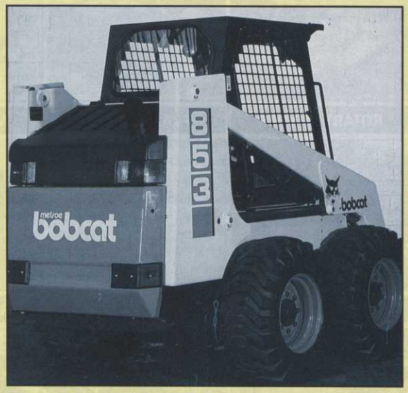
The newly-introduced Bobcat 853

It's good news then, especially for those in the golf course construction industry, that Bobcat-Melroe Europe have introduced a second larger model in their 50 series, the 853, with an operating capacity of 771kg. Details from Bobcat-Melroe on 0455 251725.