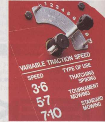
Optional variable speed kit ensures precision cutting by allowing the operator to select a consistent ground speed while maintaining a constant, even clip.

Every course and its greens have their own special characteristics. The TORO Greensmaster 3000D enjoys the challenge and by providing fully floating cutting units, a uniform quality of cut is assured whatever the conditions.