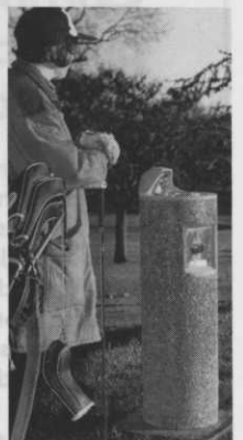
Pictured: left, the teak Mendip seat by Lister/Geebro. Above: vandal-resistant fountain by Maestro

The state of Golf Course furniture, equipment and signs, mirrors the image of the club... at least to the casual observer. Greenkeeper International suggests ways to give every club that certain something to make golfers keep on coming back