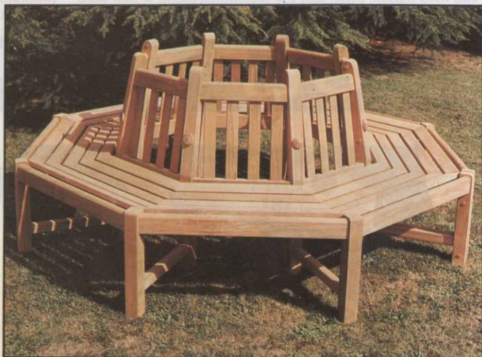
Tree seat by Britannic Teak

Neat direction indicators, maintenance free plastic coated chain fencing, putting green flags, water hazard ball retrievers, when in apple-pie order, (which means free from rust and not ready for the scrap-heap,) these will create an orderly appearance that will say to the visitor or member – here is a Club that is proud, stylish and orderly. The kudos will quite rightly belong to the greenkeeper.