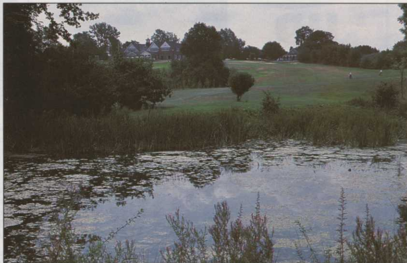
Above - Sundridge Park Golf Course, Kent. On Pages 14, 15 - Church Stretton Golf Course, Shropshire

If it hasn't done so already, golf has to grow up very quickly to meet this new status. It must be aware of its position in the world at large. That it is doing so, and very well, is expressed in the initiatives which the Royal and Ancient's Greenkeeping Panel have taken in issuing their two discussion documents 'The Way Forward' and 'The Demand for Golf'. 'The Way Forward' recognises in particular that 'when managing the land on which golf is played we must ensure that greenkeeping practices are beyond reproach from the rest of the community. The