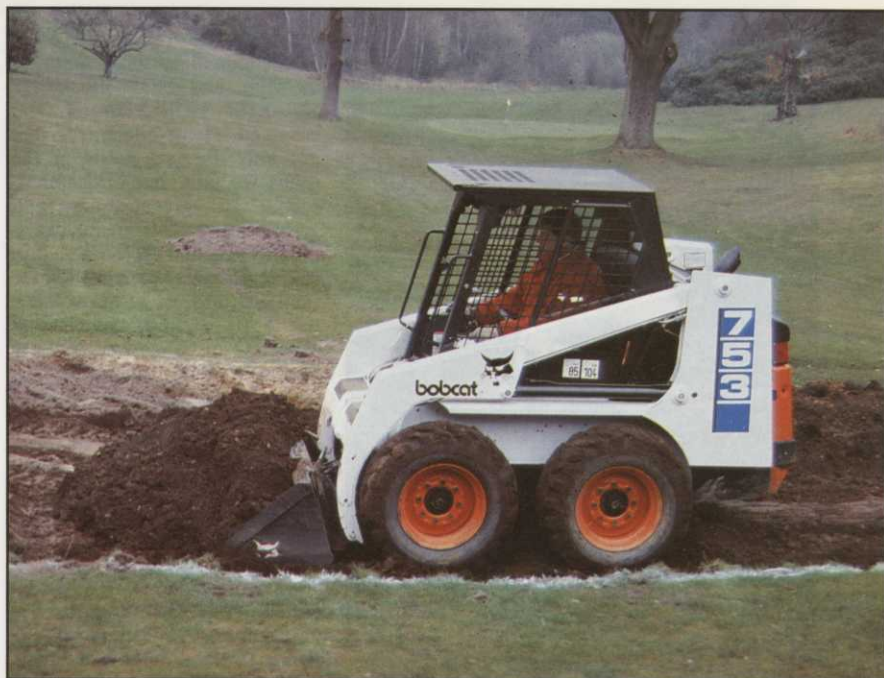
Bobcat 753 in action at Pennyhill Park

Of the course itself, it is another that claims no architect. Built just ten years ago, it has impossibly sloping greens, is on one of the highest points in Surrey – with resultant drying winds a constant negative factor – and has only about 1" of topsoil in some places. It has no automatic irrigation yet