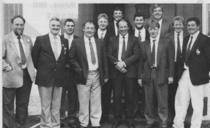
The Ayrshire group at Bogside Golf Club