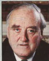
President The Rt. Hon. Viscount Whitelaw K.T., C.H., M.C., D.L.