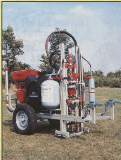
Pictured: The Terralift pneumatic Soil Conditioning Unit.

■ Colin Pryce, who has been operating a Terralift soil aeration service for the past four years, has formed a new company, C & P Soilcare Ltd. The new company will provide a complete soil care service and includes compressed air soil aeration, soil analysis and supply of conditioners which can be injected by Terralift or incorporated by convention means. They have the knowledge to sort out seemingly unsolvable soil problems, or know a man who can!