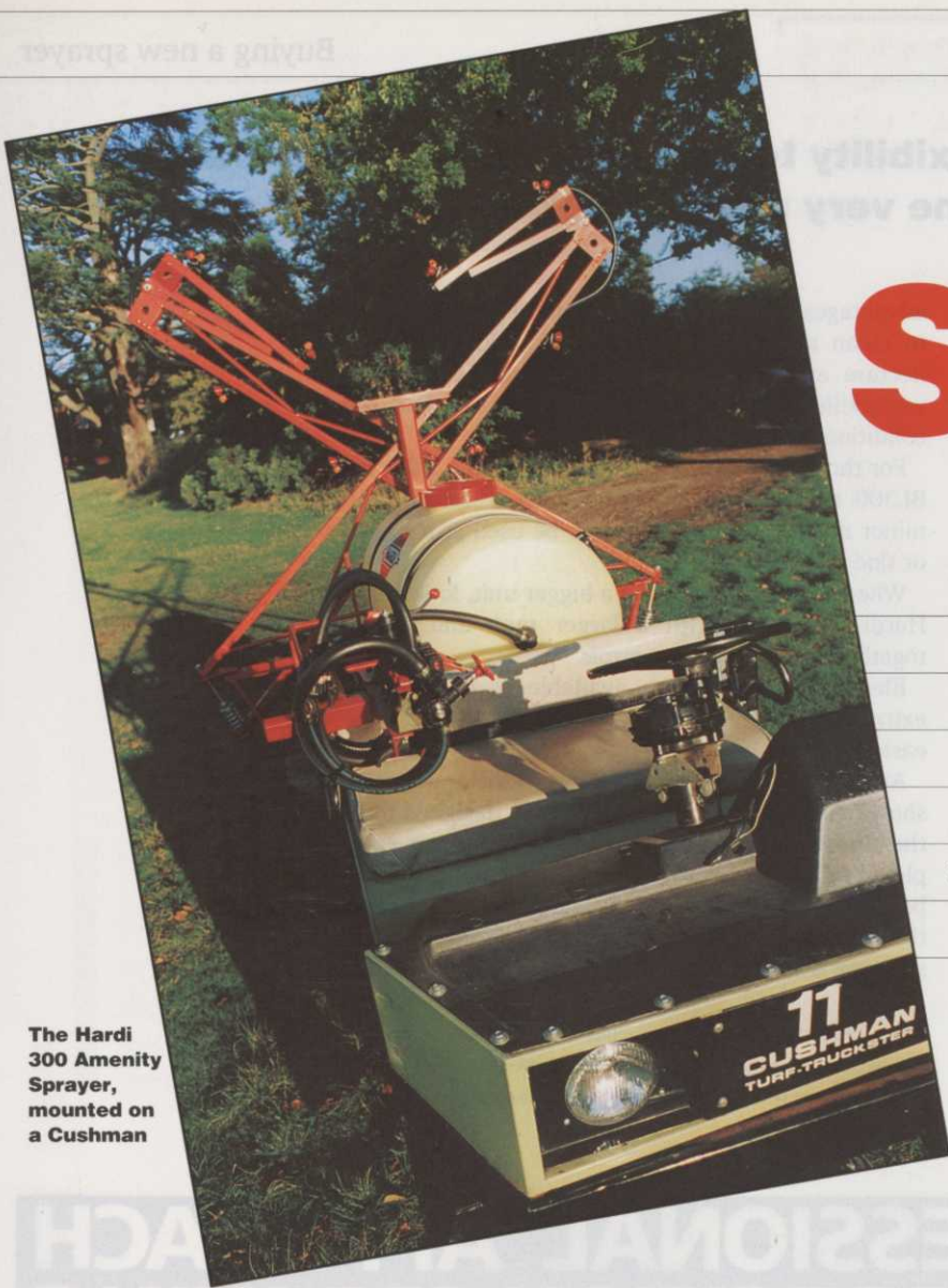
The Hardi 300 Amenity Sprayer, mounted on a Cushman