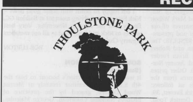
invite applications for the position of

At his fire-eating best, Jim Arthur was to have presented an uncontroversial paper but was prompted to re-write, telling us that having been brain-washed earlier at the week-end into * 38