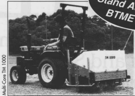
Multi-Core TM 1000