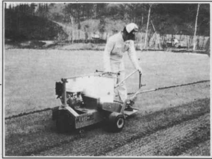
Multi-Core Green Keeper