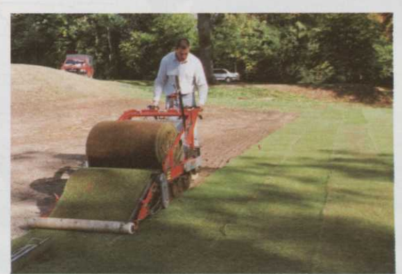
25 SQUARE YARDS ON A ROLL