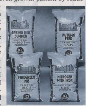
The ICI Longlife range

ing the initial flush experienced with conventional fertilisers and is available as soon as the plant starts to grow. It does not sit waiting for both temperature and moisture before N release. Because they reduce potential nitrate loss through leaching, nitrogen fertilisers based on Didin are regarded by many as being more environmentally friendly. ICI are adopting a corporate image at IOG with exhibits from ICI Professional Products, ICI Seeds and ICI Advanced Turf Systems. There is something of interest for all greenkeepers and we understand you may have some fun as well!