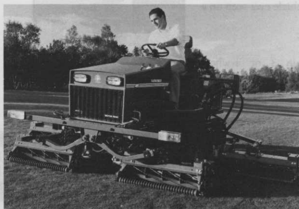
The 4 wheel drive 350D which will be on show at IOG

Two famous names, RANSOMES and CUSHMAN, will feature prominently on Ransomes stand, for Ransomes acquisition of the Cushman Ryan group has further transformed the company from a grass cutting machinery specialist into the world's leading manufacturer of equipment for all aspects of turf care. Ransomes now offer a complete range, from pedestrian and ride-on mowers to the Cushman multipurpose Turf Truckster and Ryan aerators, power rakes and overseeders. Also shown will be equipment from Ransomes recently acquired company, Morel, which produces a range of leaf and refuse sweepers. As is always the case, Ransomes will also take the opportunity to launch new products at this year's IOG.