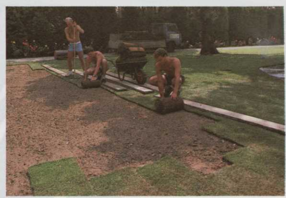
1 SQUARE YARD ON A ROLL