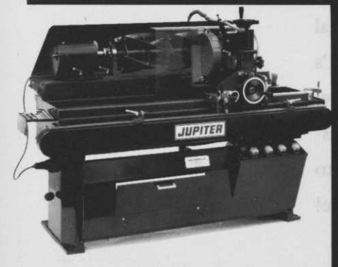
42" capacity Mower Cylinder and Bottom Blade Grinding Machine. A truly 'precision' grinder, built to last half a century. Used and preferred by Professionals.