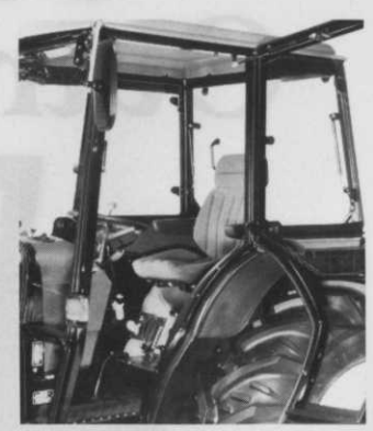
A classy John Deere cab – five new product ranges will be be on show at the IOG

CAP SOILCARE LTD , incorporating Colin Pryce Terralift, is able to offer a complete specialist soil care service. After a site visit and soil sample analysis, recommendations for treatment can be made. Soil conditioners can be specially mixed by C&P and incorporated by Terralift or conventional means. A Terralift compressed air soil injection machine will be demonstrating its ability to inject products 90cms into the soil. It will also be seen root-feeding trees. A twin probed Terralift mounted on a compact tractor will also be on display. Greenkeepers are invited to discuss their particular soil problems with Colin Pryce.