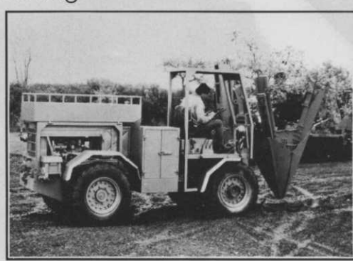
Eager Beaver Tree Spade

ed and transported by a single operator. With these new machines Ruskins aim to offer a tree moving service that will be more efficient, practical and cost-effective than anything available hitherto.