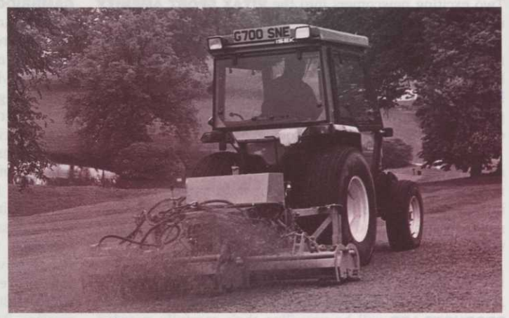
The Veemo scarifier

The Post Show Peterborough SKOW ON TOUR F