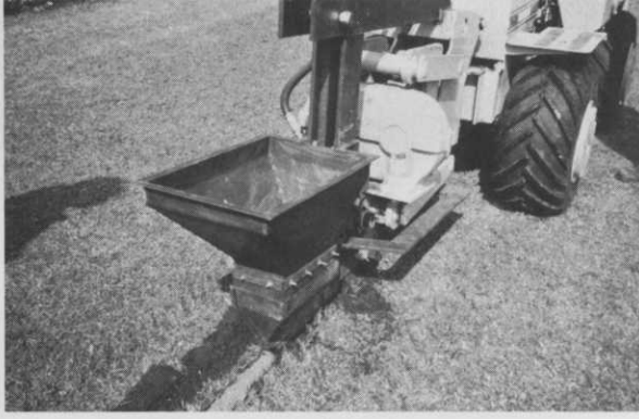
Dual Plane Oscillation

CAMBRIDGE ASSO-CIATES are unveiling Geoffrey Davidson's totally new concept which is of major significance for sportsturf. Dual Plane Oscillation is a technique with a number of applications: 1) Low cost sand slitting - one rapid pass of the machine cuts the slit, excavates the