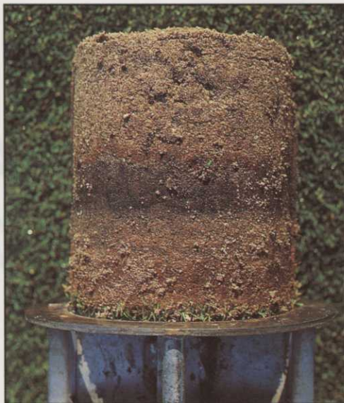
A black layer in a pure sand green. This layer has developed because conditions in the green are anaerobic for long periods, due to inappropriate choice of sand and deficiencies in maintenance. This is formed by metallic sulphides (e.g. iron sulphide) which are created under intensely anaerobic conditions by sulphur-reducing bacteria. These intense anaerobic conditions are sufficient to kill turfgrass roots

green continues to hold water in the rootzone despite allowing water to pass freely into the drains.