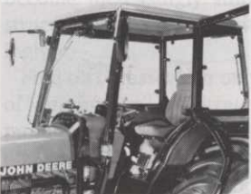
The John Deere Cab – luxury personified

Drainage, coring and a number of other operations require especially low speeds and many tractors offer an optional creeper gear. On some this is easily installed without dismantling, whilst on others it becomes a factory built job. Forty km/h (25 mph) available on many