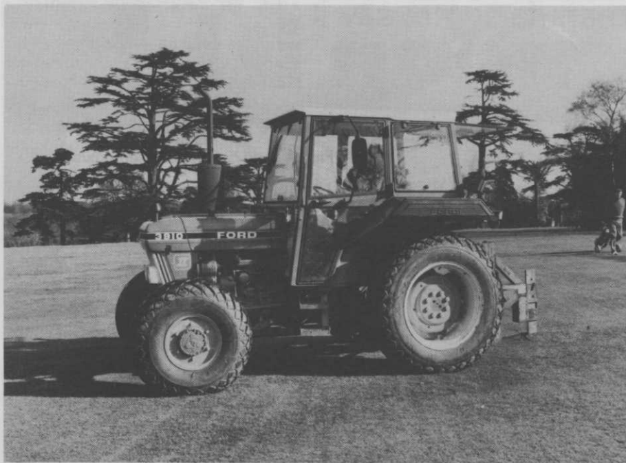
Ford's 3910 four-wheel drive tractor with turf tyres at work mole ploughing Dyrham Park fairways.

"We purchased the Verti-drain to improve the condition of greens and we required a powerful, but lightweight, tractor to operate the unit," said head greenkeeper Keith Chinery.