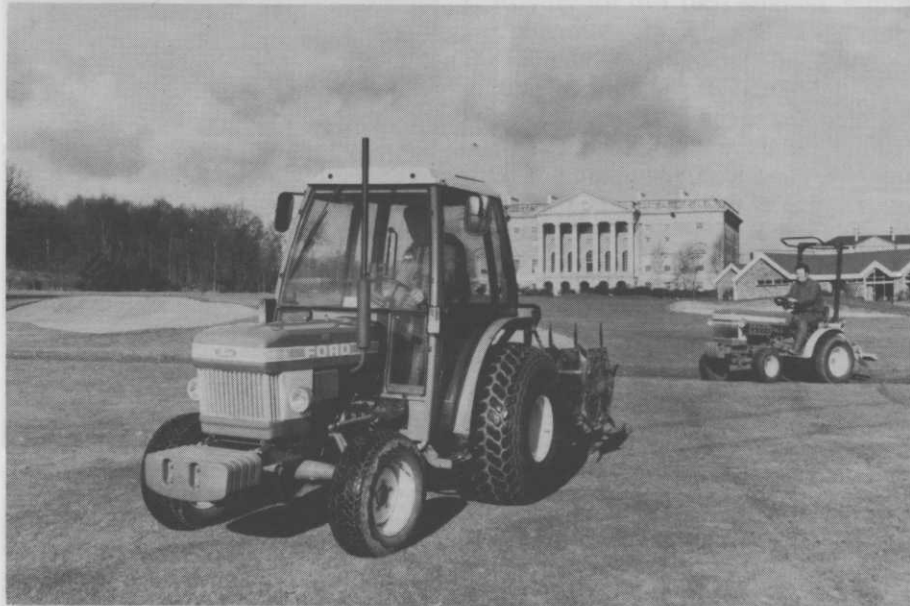
A 1910 Ford Compact tractor with turf splitter and a 1210 tractor with mole plough at Thorndon Park.

With the combination of lightweight, but powerful, tractors from Ford and turf/grassland tyres, it is now possible to drain and maintain golf courses on heavy clay land throughout the year.