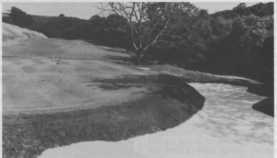
St Mellion's championship course.

Water, drawn from two man-made lakes, is distributed from two pumpstations, each housing three Grundfos CR16s, one Grundfos CR4, a control system and a pressure tank.