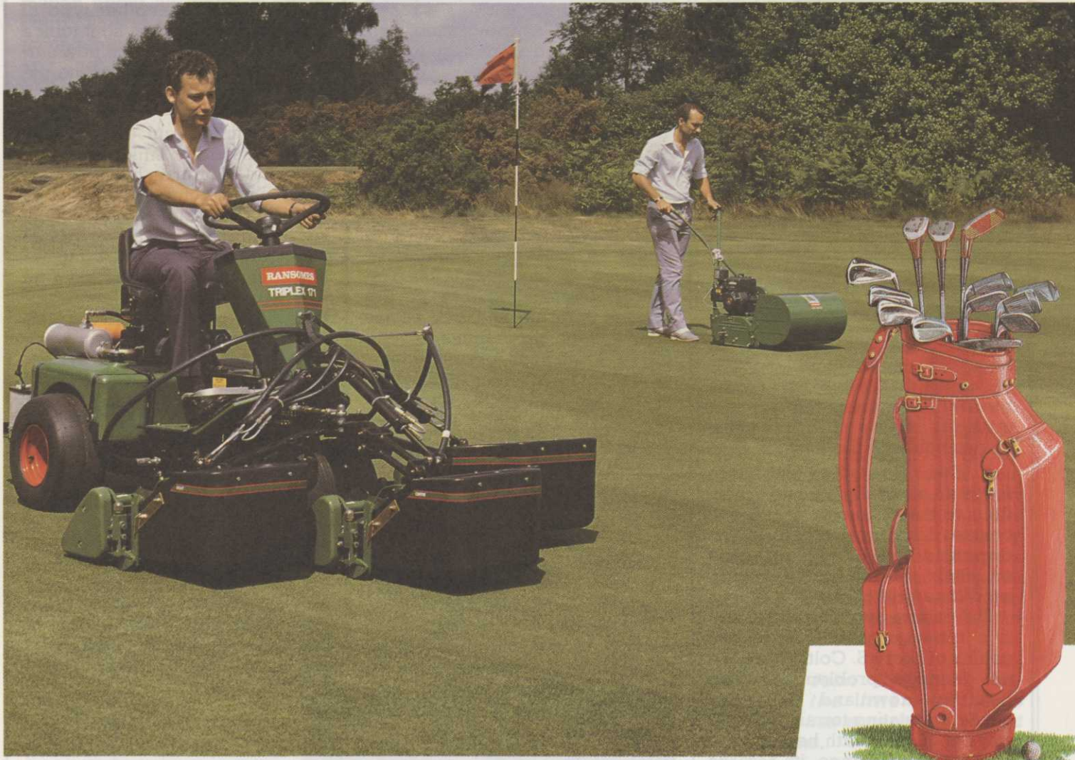
MOUNTED HYDRAULIC 5