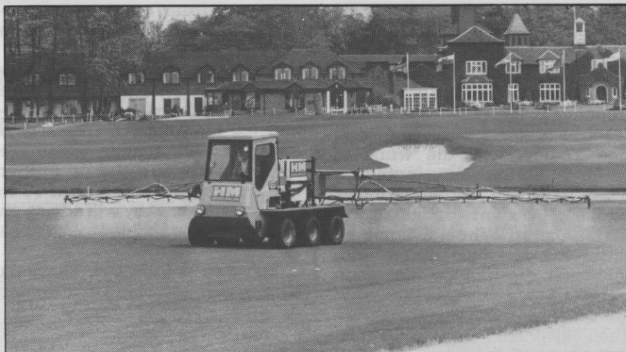
The Hodges & Moss low ground pressures sprayer at work.

affected by the changes and almost all technical and sales staff will be integrated into the new structure, which will become effective from next January.