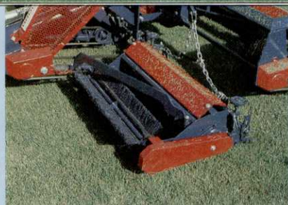
Track Removal Brush