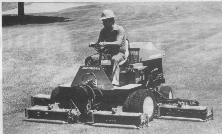
The Jacobsen HF-5.