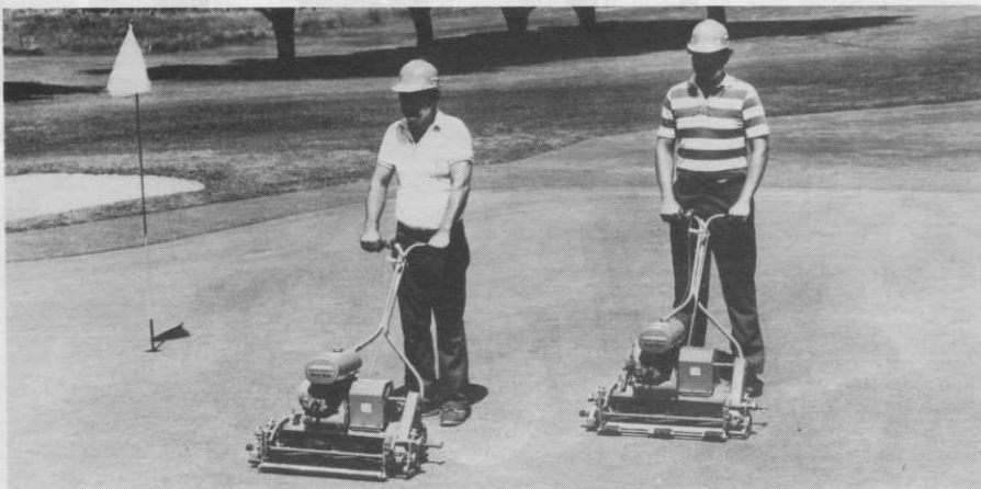
Jacobsen Greens Mower accessories - left: the powered rotary brush and (right) the powered vertical reels.

The HF-5 is one of 55 Jacobsen machines available in the UK.