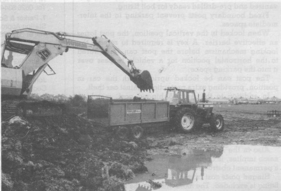
Construction of a new 18th green and practice putting green at Weymouth, showing the problems of working a heavy clay site in wet weather.