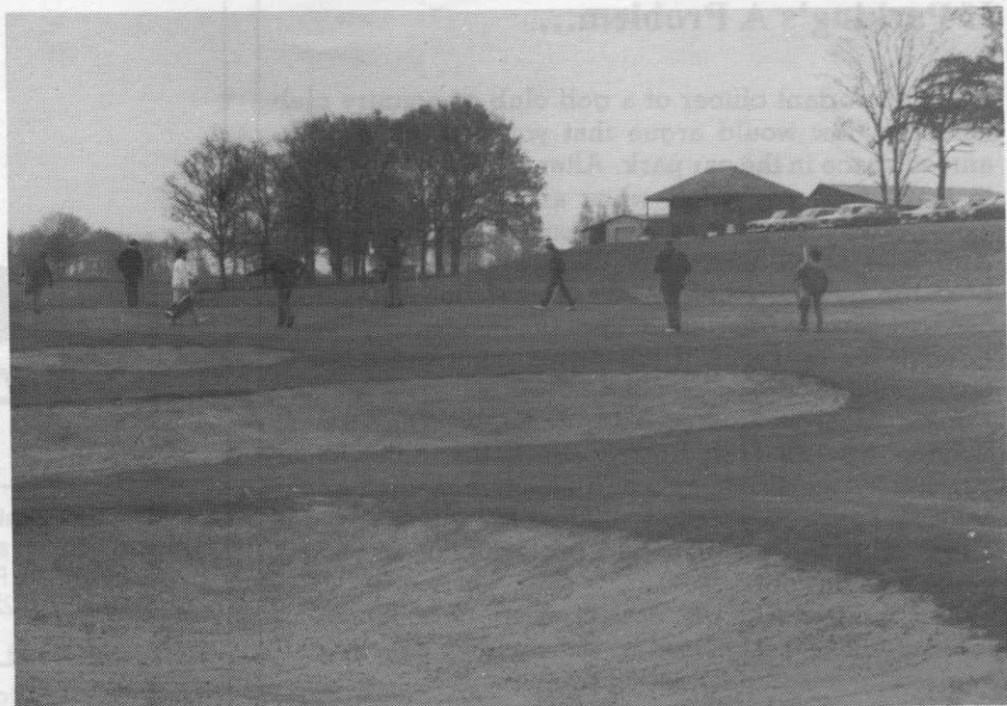
A view of the 9th green with the Radley clubhouse beyond.

Full details from Brian D. Pierson (Contractors), 27 Vicarage Road, Verwood, Wimborne, Dorset BH21 6DR. Tel: 0202 822372/824906.