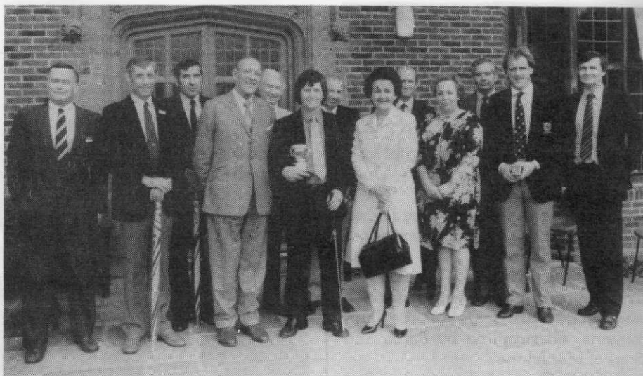
Directors of T. Parker & Sons, their wives and the prize-winners gathered after the event.