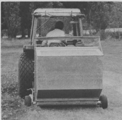
Bob Andrews' Lawn Genie cutting and collecting fairway rough.

The company's exhibit will consist of a complete product range, including Bluebird Power Turf Scarifiers, Lawn Doctor Power Turf Scarifiers, Turf-Punch Turf Aerators, Lawn Genie Tractor Drawn 'Cut and Collect' Mowers, Billy Goat sweepers and blowers, Cyclone Centrifugal Fertiliser Spreaders, Ascot Lightweight Bunker Rakes and portable generators.