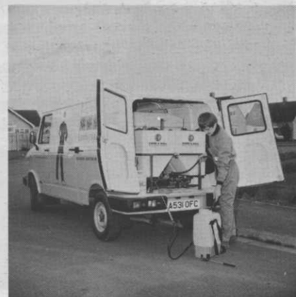
Service by Complete Weed Control.

Complete Weed Control will be showing two new pieces of equipment. Developed with a particular type of contract service in mind, both are designed for those with small areas to maintain. The company has built an electric sprayer, powered by a 24 volt battery system, which is potentially capable of covering 15 acres per day. Ideally suited to treat small grass areas and footpaths with its detachable 2m boom, this sprayer is totally silent in operation. Also recently developed is a highly specialised van able to carry a wide range of equipment and different chemicals. The design of the main water tank and mixing chambers enables the operator to choose and apply the appropriate treatment without the risk of cross-contamination.