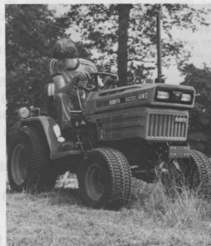
One of a new range - Kubota's B6200.

The 200 series, with new features and distinctive styling, provides excellent operator comfort and ease-of-working.