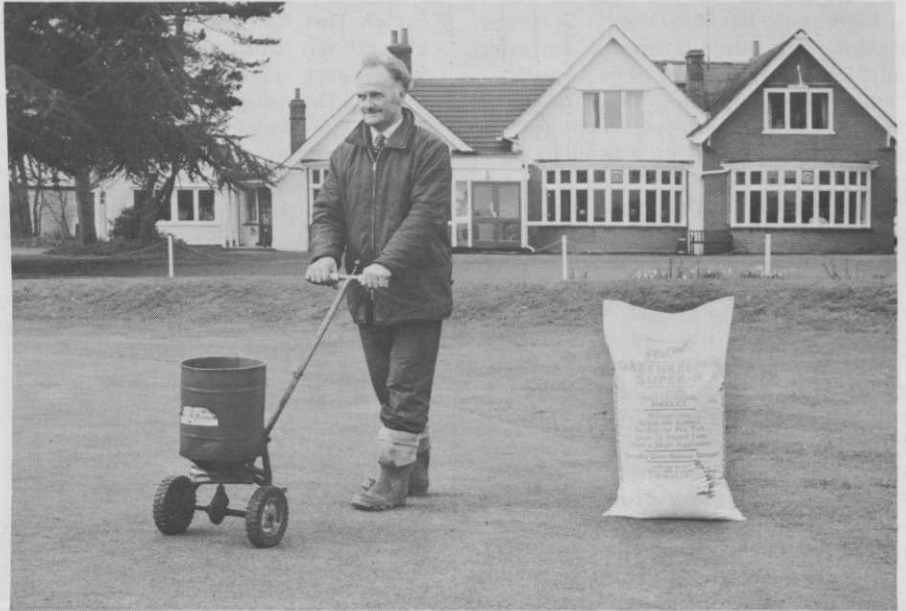
Greenkeeper Super-N from Fisons will be on show at Windsor.

Fisons Horticulture will launch a new product for the professional groundsman. The Fisons stand will also feature a demonstration of the new slow release nitrogenous fine turf fertiliser Greenkeeper Super-N. Launched at last year's exhibition, Greenkeeper Super-N has proved especially popular because of the reduced number of applications required to keep nitrogen levels at the optimum. One application of Greenkeeper Super-N, which contains both rapid and slow release nitrogen sources, will provide a steady nutrient flow for three months, producing a healthy, actively growing, resilient sward. Information will also be available on Fisons' full range of turf fertilisers, top dressings and chemicals, concentrating in particular on the autumn turf care products — Greenkeeper 1 (fine turf fertiliser), PS3 (outfield turf fertiliser), Turfclear (combined turf fungicide and worm-killer) and the top dressings Humull, Humull and Sand and Sports Turf Compost.