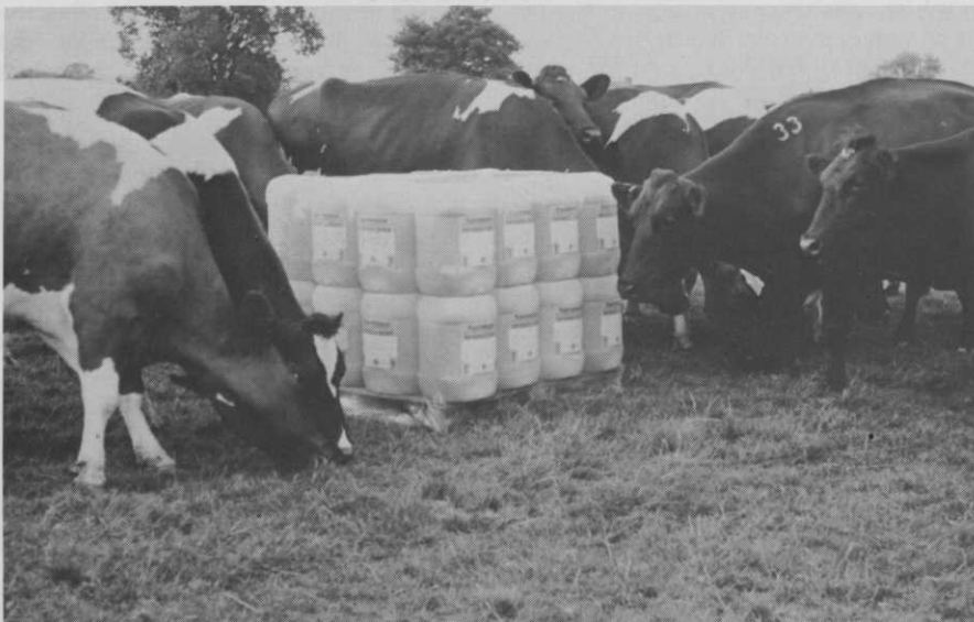
Farmura says: 'Not only Carnation comes from cows!'

Farmura is exhibiting its range of environmentally safe products. Highlighted will be Farmura Liquid Organic Fertiliser, now a successful part of turf management programmes. Farmura encourages root development, tillering and resistance to stress. Used as part of reseeding programmes, Farmura helps the establishment of new turf. Case histories will be on display. New developments from the company include Farmura Green for fine turf and new colour-coded packaging for easy identification. A free prize draw will be held on Thursday.