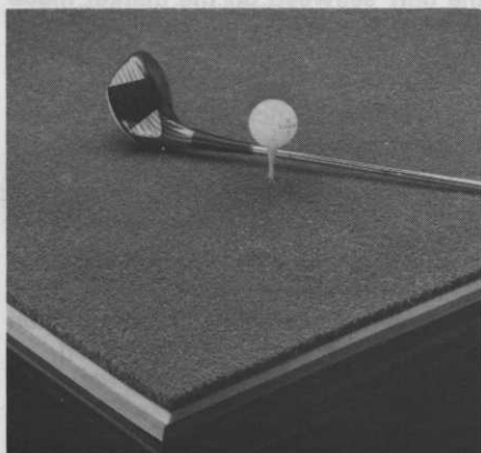
The Super Tee golf mat with polyethylene underpad.

Super Tees are distributed by T. Parker and Son of Worcester Park and Supaturf Products of Perterborough.