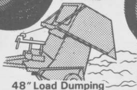
48" Load Dumping