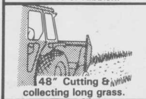
48" Cutting & collecting long grass.