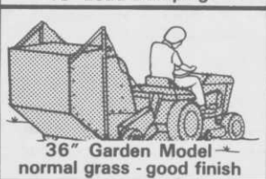
36" Garden Model normal grass - good finish