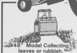
48" Model Collecting leaves or rubbish.