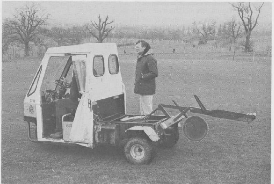
Norman Leddy, manager of parks and woodlands for the London borough of Hillingdon, stands beside a Cushman Three-Wheel Truckster at Harefield Place Golf Course, Uxbridge. Mounted on the rear hydraulic linkage is a variable-depth moleblade with turf-slicing disc coupler for relieving compaction and improving drainage on greens and surrounds.

"Versatility, reliability and service back-up were also major considerations when it came to the final selection. The Cushman Turf Care System fitted the bill in all areas for all-round practicality and flexibility."