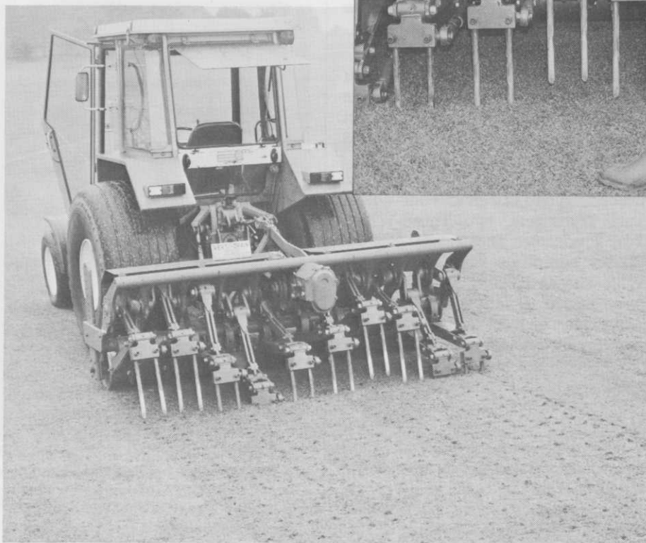
These pictures offer a persuasive argument for the Verti-Drain's capabilities.

"Many things have been said recently about the types of spiking that can compact the side walls where the tine has penetrated. My opinion is that if spiking is done at the beginning of the winter, natural elements, such as frost, assist you and help achieve the necessary results. We are always on the look-out for better and more efficient aeration equipment and the