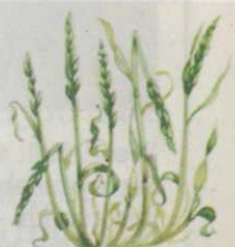
PERENNIAL RYE GRASS