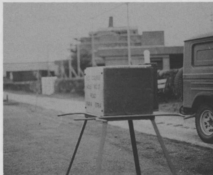
The famous black sheds are being restored within the grounds of the Old Course Hotel complex.