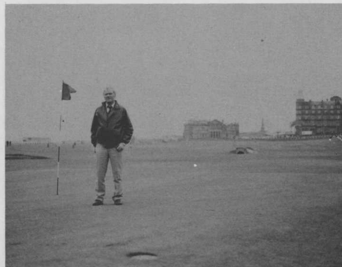
The 17th green with the Royal and Ancient clubhouse and Hamilton Hall in the background.