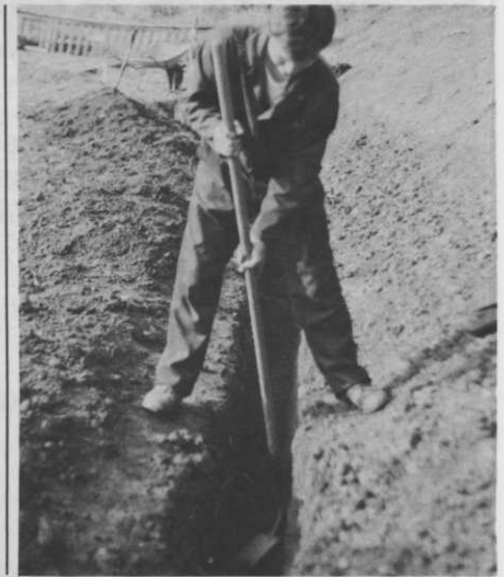
All in the course of a day's work at Oatridge Agricultural College, West Lothian. Top: students tackle drain installation. Middle: a perimeter drain is dug. Bottom: a group learns the basics of green construction.

Oatridge Agricultural College, Ecclesmachan, Broxburn, West Lothian EH52 6NH. (0506) 854387.