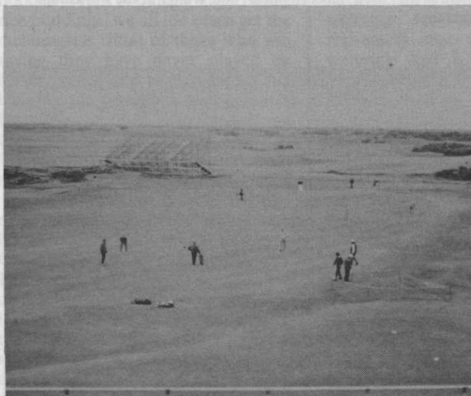
An elevated view of the green for holes 8 and 10. The spectator stand is by the 9th tee.