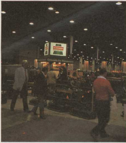
GCSAA trade show in full swing.

Jim Arthur brought matters to a close, by which time only 45 remained in a room capable of holding over 300. No doubt Jim would have had some very interesting words for the 400 who attended the 'black layer' gathering next door.