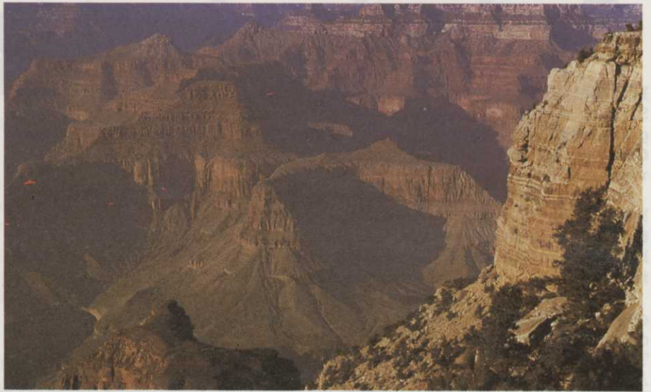
Grand Canyon, Arizona.

I enjoyed the best of the season's tips, which are the ideas USGA agronomists pick up as they visit clubs around the country and pass on each year to