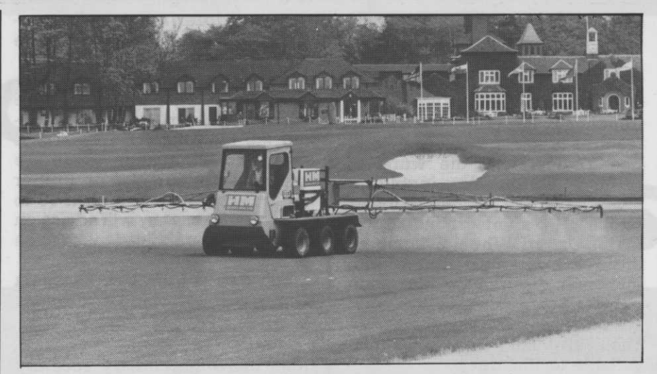
The Hodges & Moss low ground pressures sprayer at work.

affected by the changes and almost all technical and sales staff will be integrated into the new structure, which will become effective from next January.