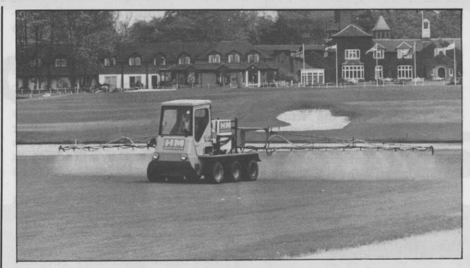
The Hodges & Moss low ground pressures sprayer at work.

affected by the changes and almost all technical and sales staff will be integrated into the new structure, which will become effective from next January.