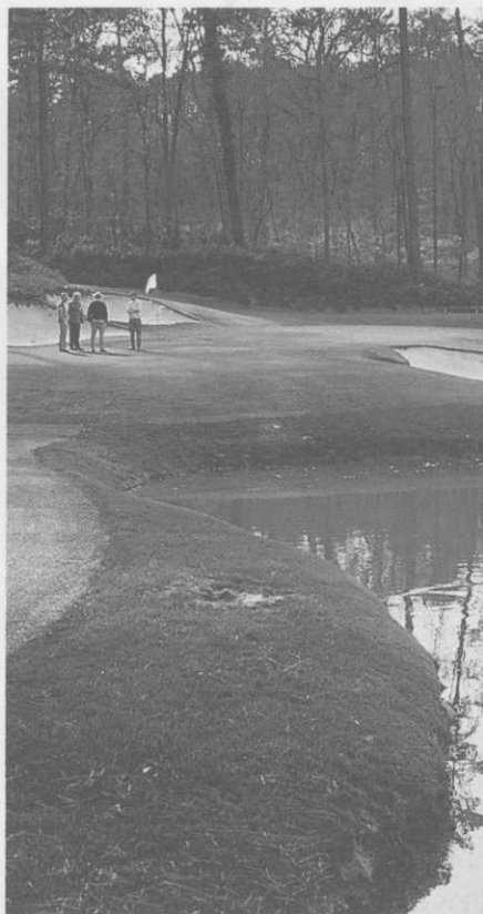
Augusta - often desired by UK golfers.

Perhaps the first stage would be to put the unions themselves on the list for this particular type of education. It must be at least ten years since Peter Thomson remarked that the essence of good golf is ball control and that you can't learn that on soft,