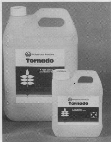
ICI's Tornado - large and small.

ICI has relaunched Daconil on to the sports and amenity turf grass market. The fungicide contains chlorothalonil, a chemical with the widest spectrum of turf disease control recommendations cleared under the UK Pesticide Registration Scheme.