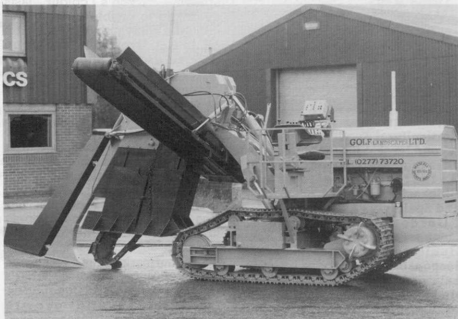
More power to Golf Landscapes...

Digging width can be varied from 4in to 12in and to a maximum depth of 4ft. Laser control ensures even and correct grading and allows the company's turfgrass drainage team to instal piped and slit systems to grass areas, without damage to turf, efficiently and economically.