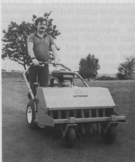
The Autocrat (left) and the Auto-Turfman Mk 2.

5ins. Minimal surface disturbance and absence of load on wheels make it ideal for soft ground conditions. A 3ft spiker-slitter is available for front mounting, as is a transport trolley.