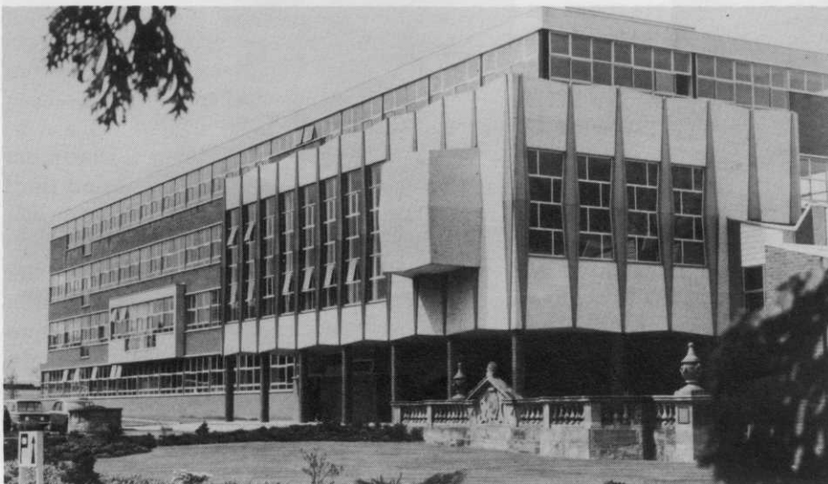
One of the best - Elmwood College.