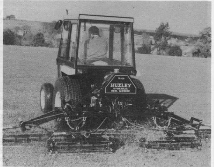
Two new lines from Huxley - the TR84 and the TR138.