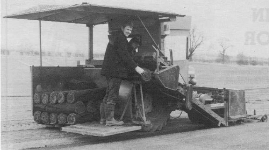
Turf is harvested by equipment that mows, cuts and rolls all in one go.

Rolawn, the turf growers, has been harvesting orders for some prestigious locations recently. The company, which has over a thousand acres of purpose-grown turf throughout the country, has supplied turf to Wimbledon from its Yorkshire base, the Chelsea Flower Show from its unit in Bedfordshire, as well as the National Trust for Scotland and the new Cloister Gallery extension to the Tate Gallery in London.