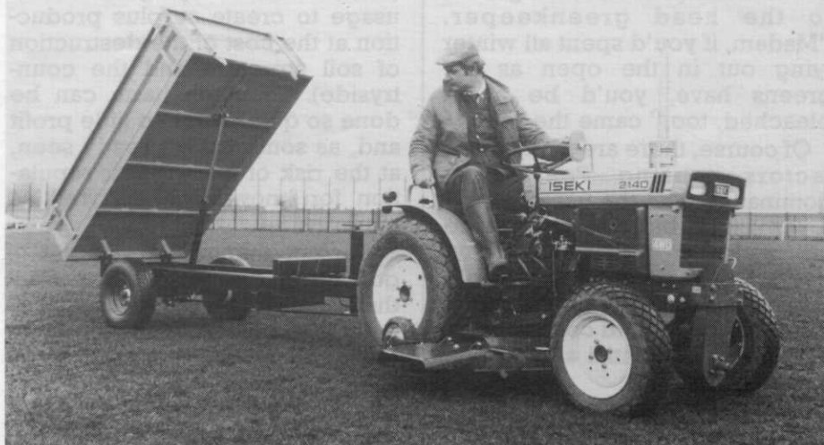
The Iseki TX 2140, with trailer behind, going through its paces.

Hampshire County Council has invested in 16 Ford 1210 compact tractors with four-wheel drive option to team up with a new reel mower from Huxleys. The council had two Ford 1210s in use and the idea was to power match the tractor to a mid-mounted reel mower to produce the ideal grasscutting unit, replacing the dedicated self-propelled mowers already in operation. Due to demand for a mid-mounted reel mower, Huxleys developed the TR84M hydraulically-powered model with a 7ft cutting width.