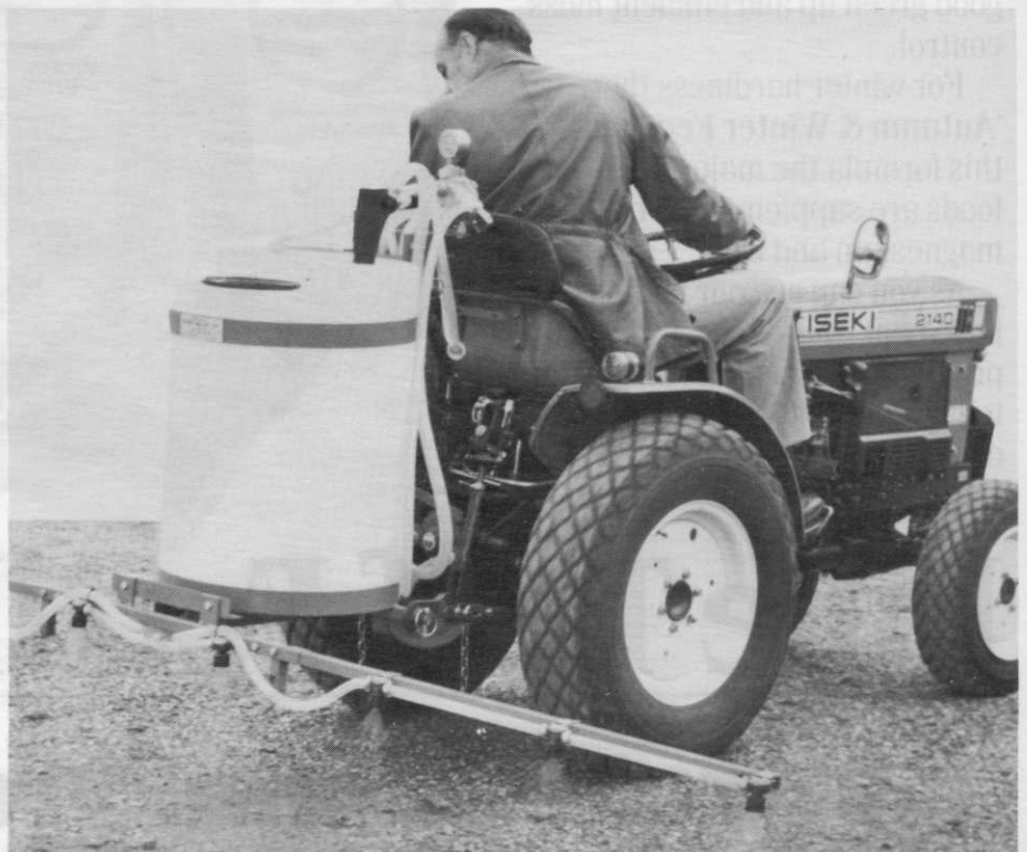
The Lely Iseki 2140 4WD with spray equipment.

Full details from Lely Iseki Tractors, Crosshall Works, Gt North Road, Eaton Ford, Cambs PE19 1QH. Tel: 0480 76971.