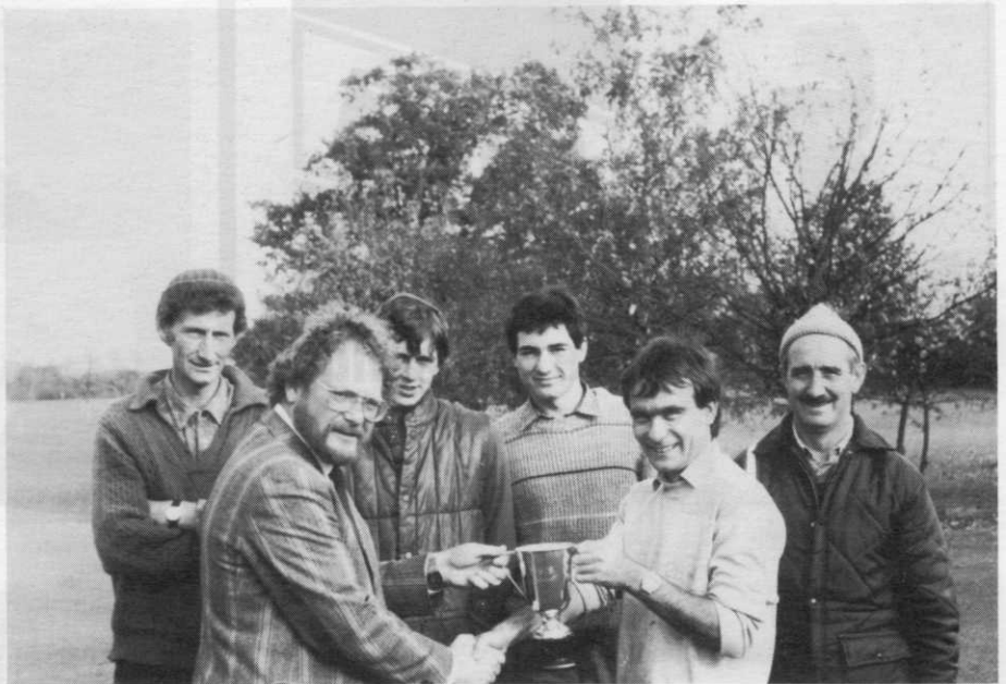
Setting a fine example - staff of Astbury GC.