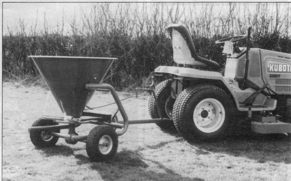
The new mini-spreader from Wessex Farm Machinery.

Wessex Farm Machinery has introduced a new trailed fertiliser distributor suitable for professional or domestic use.