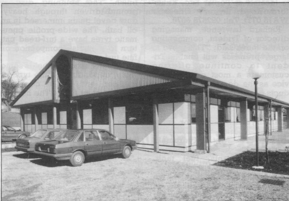
A building of modern design for the STRI establishment.

with Tufturf, offering obvious labour savings and reductions in installation costs.