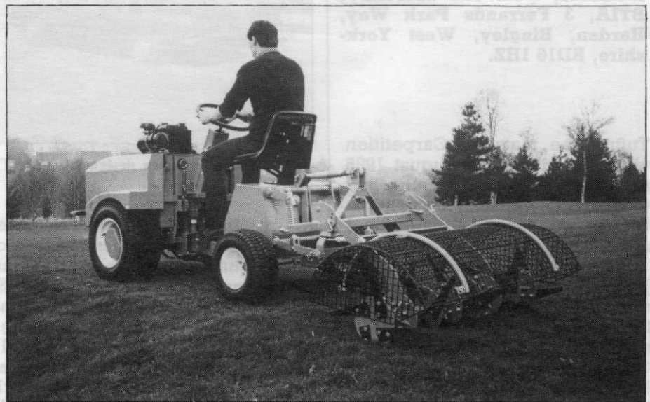
The SISIS Hydromain Fourteen Mk 11 fitted with a deep slitter.