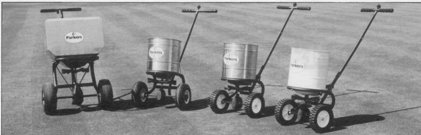
The Master, Super Professional, Professional and Standard - all from Parkers.

Full details from T. Parker & Sons (Turf Management), Worcester Park, Surrey KT4 7NF. Tel: 01-337 7791.