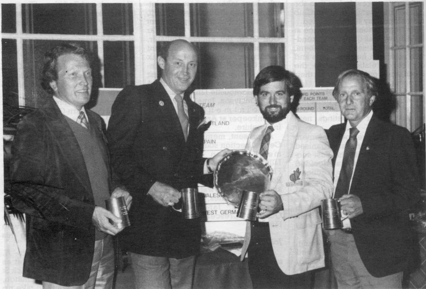
The winning Canadian team — Successful Defenders, with their trophies.