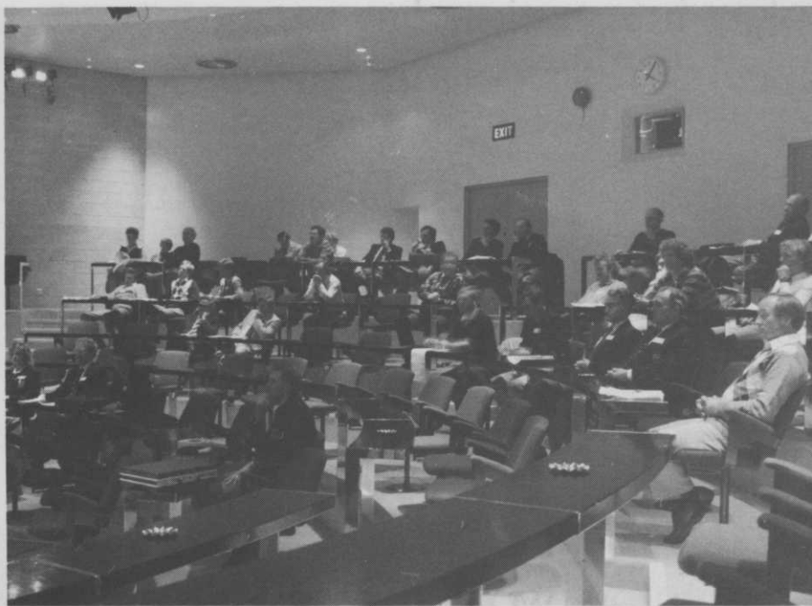
An attentive audience in the lecture theatre.

for East Anglia, had received a clear indication from his branch members that they would not be prepared to pay the increased sum. The board of management also felt it could not justify charging this amount.