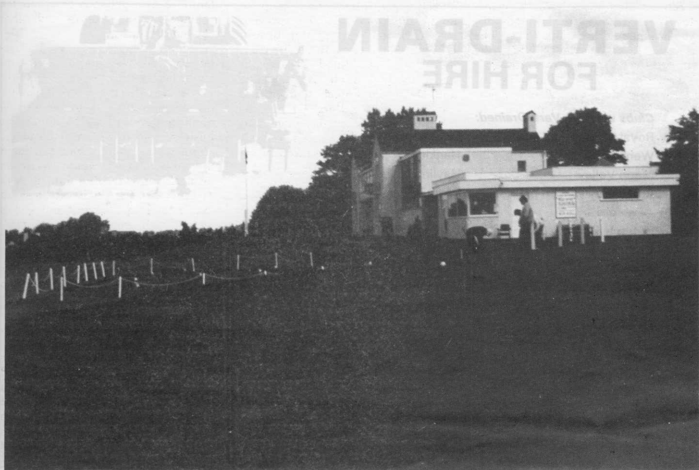
Heswall's clubhouse occupies a commanding position.