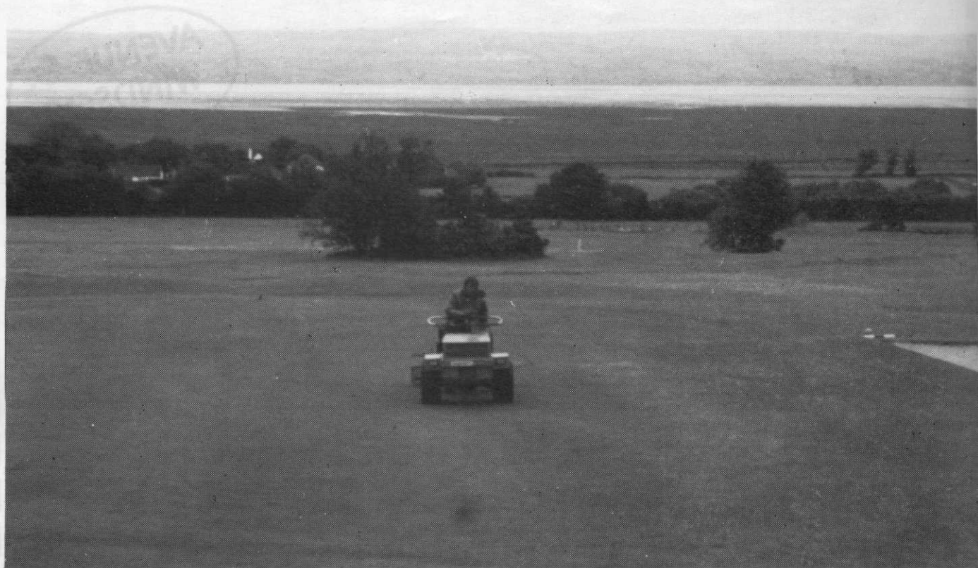
The Dee Estuary and Welsh coast provide the backdrop as a Hydromain works the 18th green.