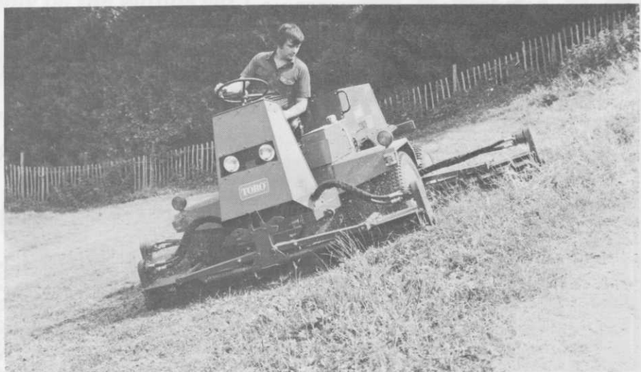
Top to bottom: four stages of production. Above: the finished product shows excellent hillside stability and traction...

• Greenkeeper has been asked to point out that while Gibsons of Kirkham, Lancashire are the appointed Toro commercial dealers, they do not offer the Lely Iseki range of tractors.