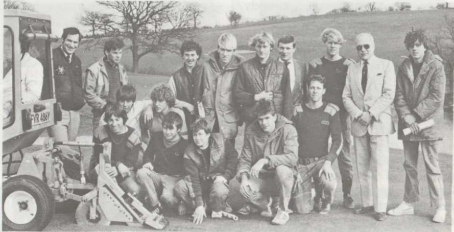
Burt's Boys—the greenkeepers of tomorrow.

struction, grasses and cultivational control methods. SISIS demonstrated the Hydromain System.