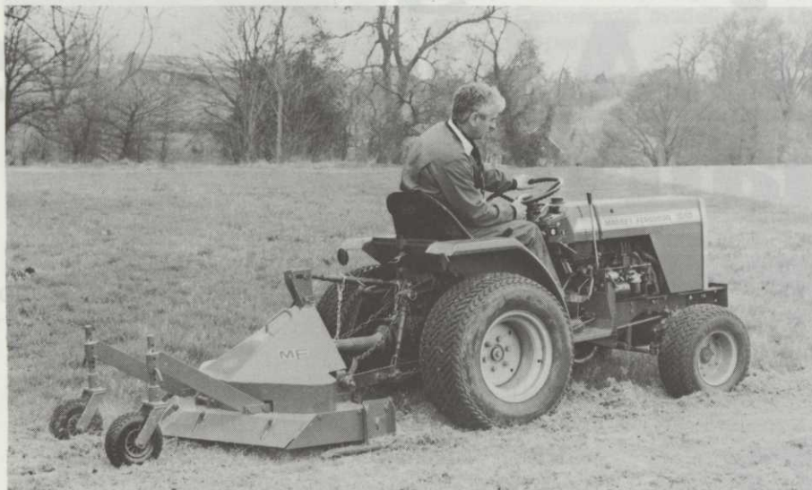
Massey-Ferguson is introducing a new range of versatile compact tractors to the UK. The MF 1010 produces 16 engine hp and is the smallest of the three new machines for which rear- or mid-mounted mowers will be available, as well as a wide range of other equipment including loaders, diggers and rotary cultivators.

Servicing the tractors has been made quick and simple with a tilting bonnet, released by a push button, which gives access to the battery, radiator, air cleaner and engine. Engine and transmission/hydraulic oil filters are externally mounted and fitted with cartridge filters that are readily changed in moments.