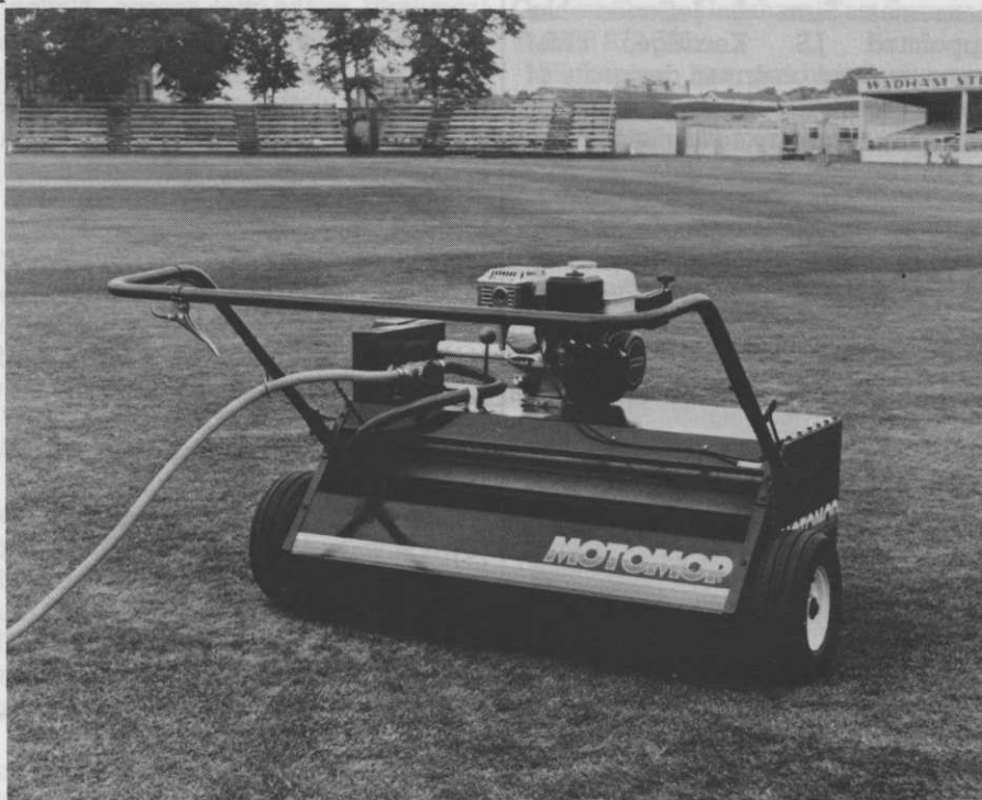
Motomop—now in the Marshall Concessionaires' camp.

Marshall Concessionaires, said: "With Motomop, we have taken into our range a proven specialist product. It has also proved itself in some important commercial applications, which we will be developing."