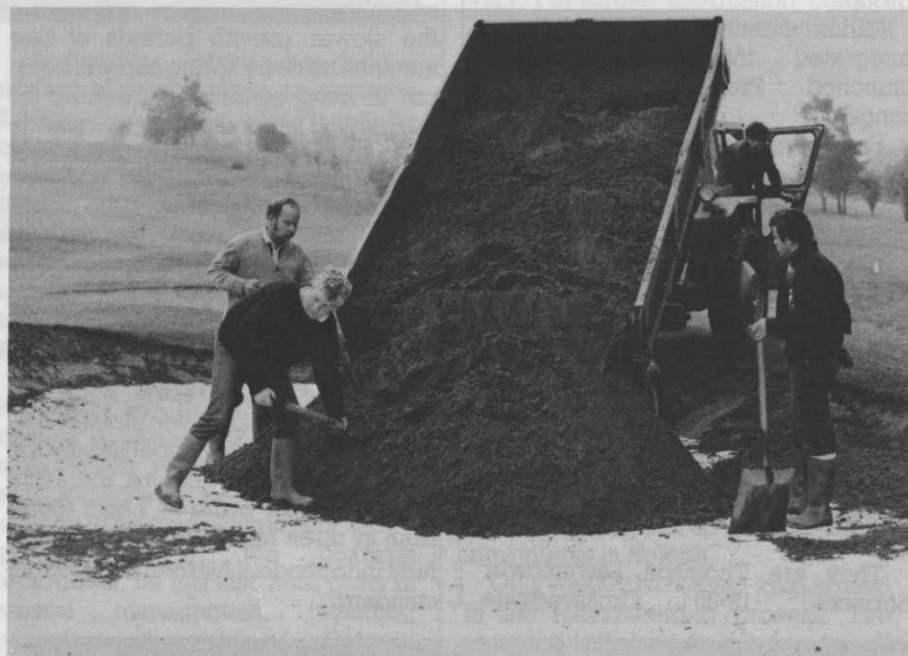
Sand is replaced in a typical bunker where a new Fryma liner has been laid.

Founded in 1922, Fryma Fabrics is the UK's leading manufacturer of knitted industrial fabric. Full details from Fryma Fabrics, Fryma House, Denison Stret, Nottingham NG7 3PJ. ☎ 0602 782141.