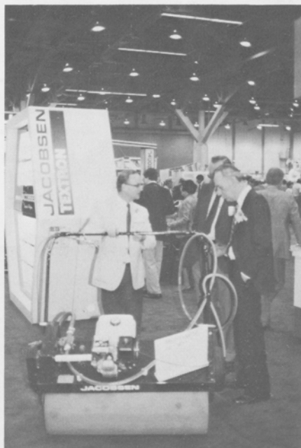
The Jacobsen Motomop on show at Las Vegas.