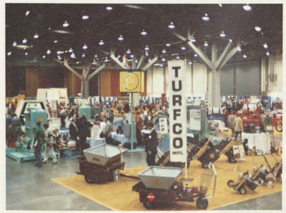
Activity in the hall.