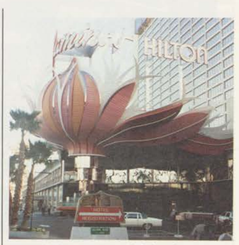
A 'swish' entrance to the Flamingo Hilton, Las Vegas.

We also drove out to the Hoover Dam, where we enjoyed a breathtaking flight over the lovely Lake Mead and the dam itself. This was definitely one of the highlights of the trip. The scenery was quite spectacular and unlike anything we had seen before, although it did seem that the pilot thought he was