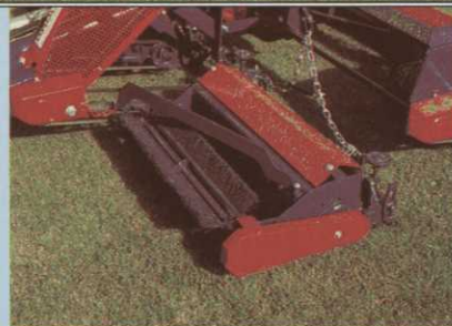
Track Removal Brush