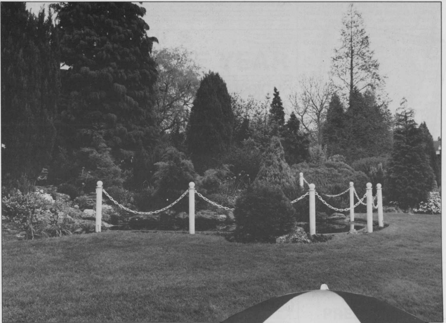
Post and chains set off a feature of the course

Fencing around the tee does give that aesthetic feel to the overall pleasure from a round of golf, but it should also be functional. Not only will it define the teeing area but will act as a bar to trolleys on the tee and separate the golfer teeing off from those observing or yet to play.