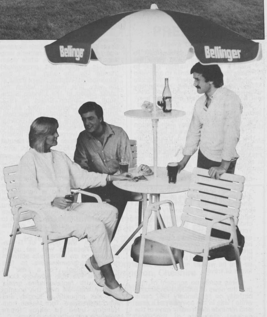
The new range of patio furniture from Bellinger Ltd.

Cast iron benches will last a lifetime as long as the vandals are kept at bay and they are given an annual coat of paint, preferably anti-rust.