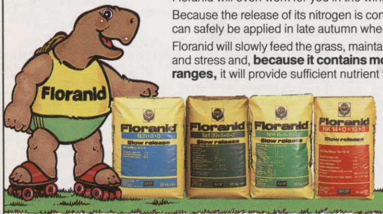
Floranid is a BASF trade mark.

BASF United Kingdom Limited, Fertiliser Department, Lady Lane, Hadleigh, Ipswich, IP7 6BQ. Tel: (0473) 822531.