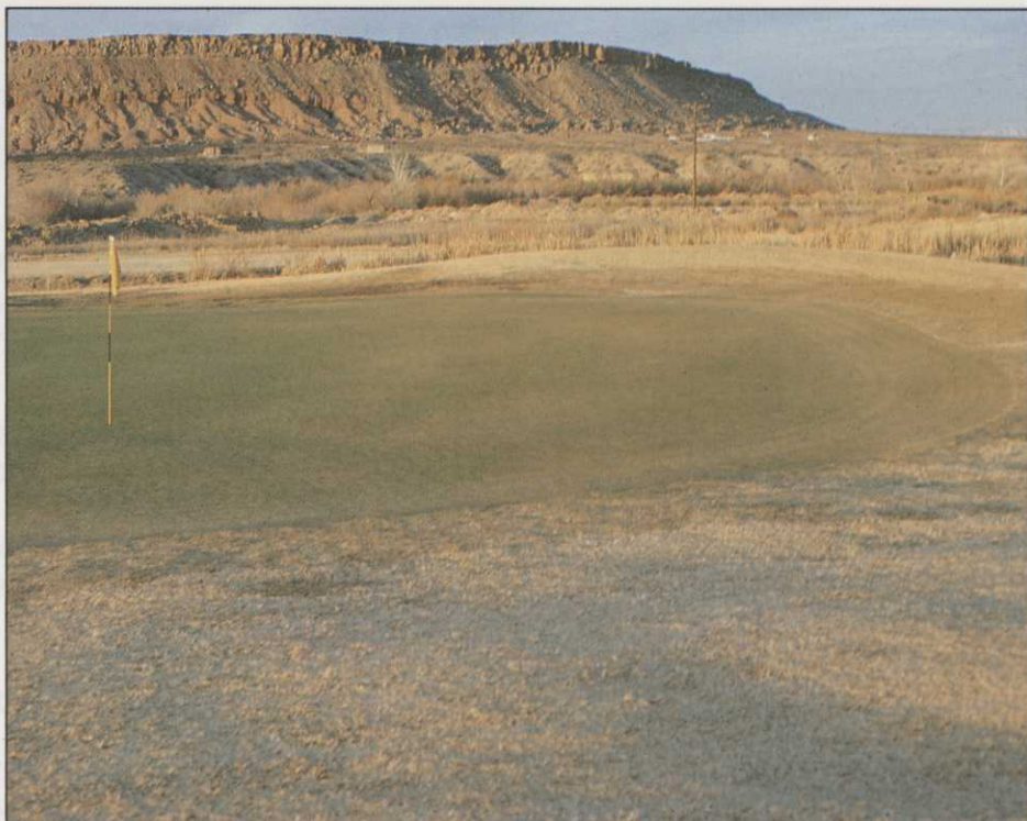
Not all golf courses are healthily irrigated even in Arizona

The United States of America is a country of extremes, both in climates and degrees of affluence. Standards of golfturf management vary considerably. Some golf courses are disappointingly poor whilst others display unbelievable excellence. Some struggle on very limited maintenance budgets, whilst others enjoy the luxury of an almost limitless one. This is not to say that it is only the wealthy Clubs that have good greens. Some low budget courses are excellent. Knowledgeable and dedicated superintendents can produce good greens, even on relatively low budgets. Understandably though, the cream of superintendents are normally offered a