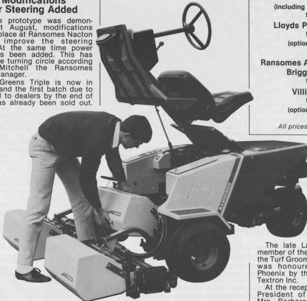
The operator's platform on Ransomes new all-hydraulic GT Triple Greens Mower can be raised in seconds for easy access to the centre cutting unit and to empty the grasscatcher.

An important feature of the Ransomes Auto Certes is its two-part fully machined smooth cast aluminium landroll with tapered ends which incorporates a differential, to make for easy turning without marking the fine turf.