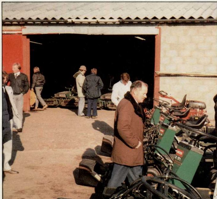
Visitors inspect the rebuilt greenkeeper's sheds at the Belfry. The wide doors allow easy access for all sizes of machinery.